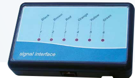
Signal Interface Module