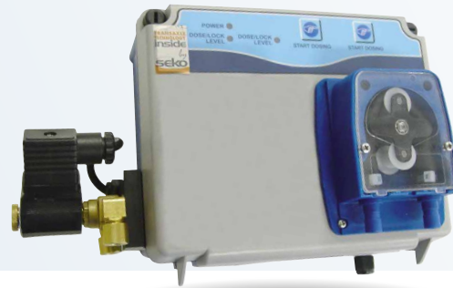
OplBasic DL Dosing system with peristaltic pump and solenoid valve