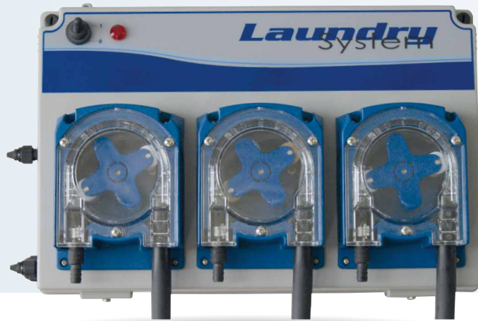
OplAdvantage HV Peristaltic dosing systems High Volume