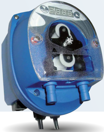
OpMini L Multi-function digital peristaltic pump