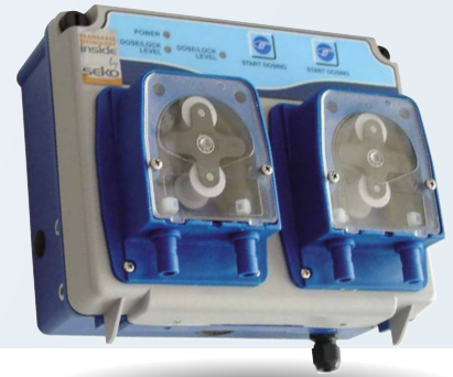
OplBasic LL Dosing system with double peristaltic