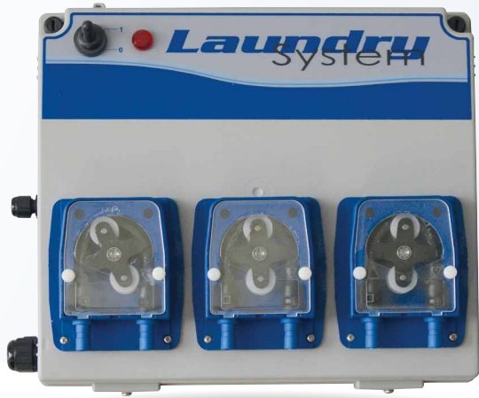
OplAdvantage LV Peristaltic dosing systems Low Volume