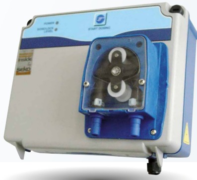
OplBasic L Dosing system with a peristaltic pump