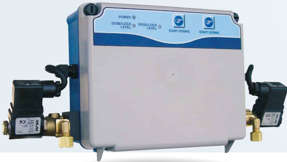
OplBasic DD Dosing system with double solenoid valves