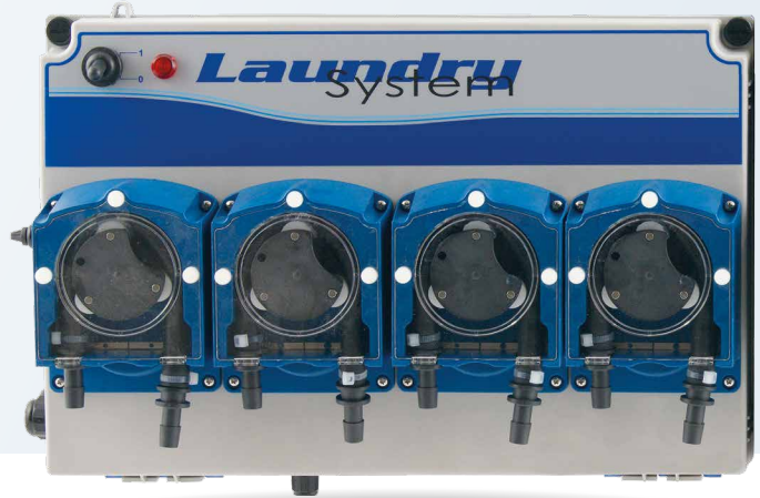
OplAdvantage SV Peristaltic dosing systems Standard Volume