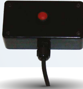
Remote Control Accessory with 8 ft. cable