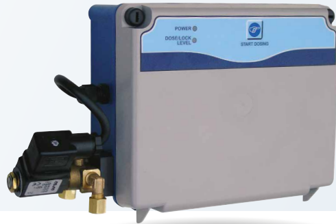
OplBasic D Dosing system with a solenoid valve